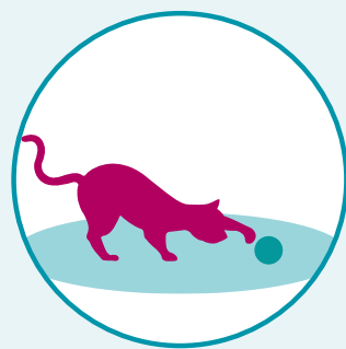
Chasing moving objects