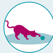
Chasing moving objects